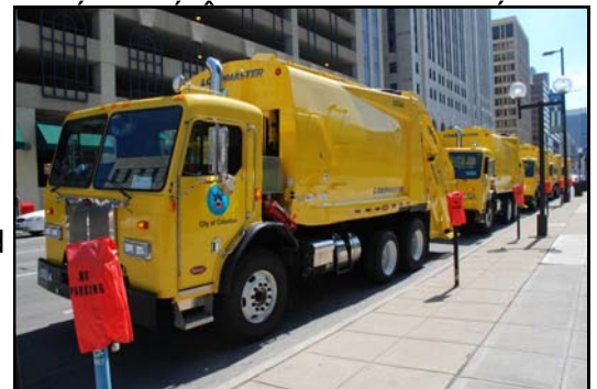
Voted bond authority allowed the city to purchase new bulk -trash vehicles to keep neighborhoods clean. Voter support of the 2008 Bond package will permit the city to continue supplying critical services such as waste and snow removal.

Michael C. Mentel City Council President